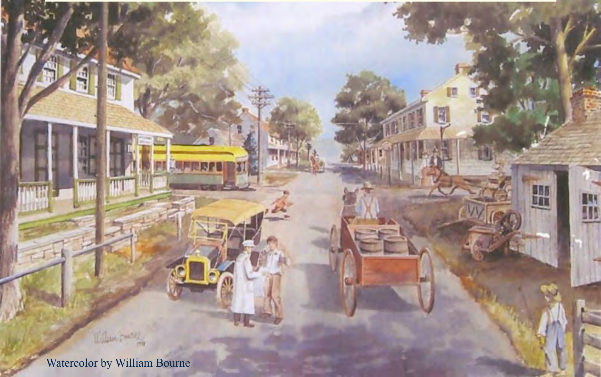
Watercolor by William Bourne